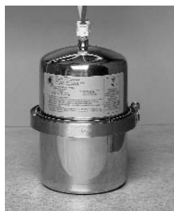
MP750SB or MP1200EL